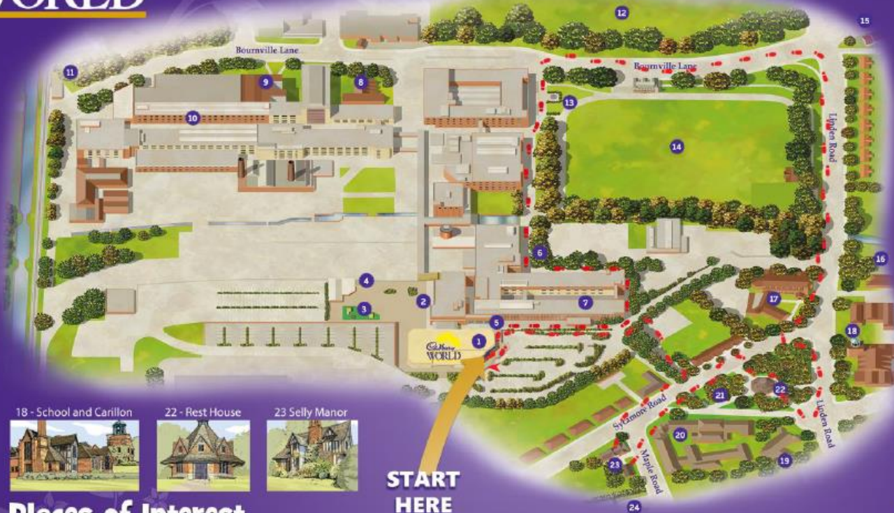
18 - School and Carillon